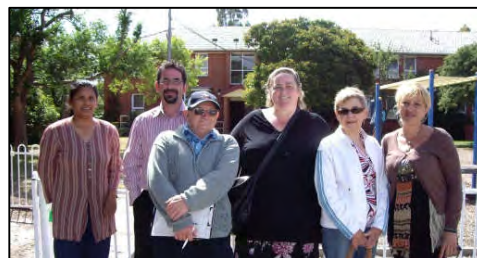
Participants in the Walk-Around Safety Audit at Tarakan Street Estate in January