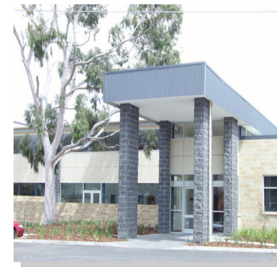
West Heidelberg Community Legal Service is co-located with Banyule Community Health (BCH facility pictured)

21 Alamein Rd West Heidelberg 3081 Ph 9450 2002 Fax 9458 1067